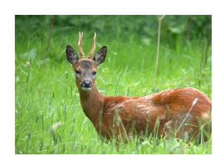
Food for deer