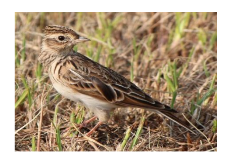
Nesting ground for larks